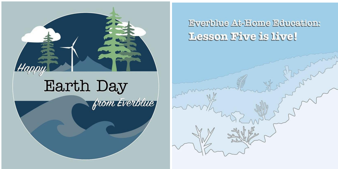
Image: Examples of graphics used to showcase announcements and educational materials on social media. Designed by Rachel Aitchison and Dominic Librie.

Everblue utilizes a suite of graphic design tools to supplement our website, lesson plans, social media posts, and newsletters. The Everblue Media and Graphics Committee is made up of professional designers who are well-versed in knowledge about how to use art, design, and media to communicate highly complex scientific topics in eye-catching and easy-to-understand formats.